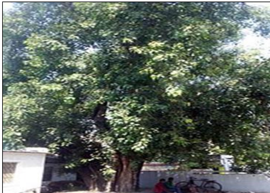
FIG. 1: PLANT OF FICUS RELIGIOSA

It is a large perennial tree, glabrous when young, found throughout the plains of India up to 170 m altitudes in the Himalayas 20 and is one of the most revered trees in Asia.