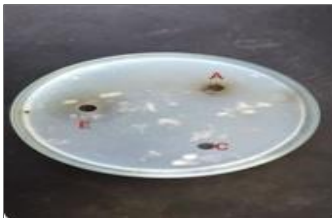
FIG. 4: ANTIMICROBIAL ACTIVITY OF AQUEOUS AND ETHANOLIC LEAF EXTRACT OF GREEN TEA ( CAMELLIA SINENSIS ) USED IN PSEUDOMONAS . ZONE INDICATES THE PRESENCE OF ANTIMICROBIAL ACTIVITY

C- Control; A- Aqueous extraction of green tea; E- Ethanolic extraction of green tea