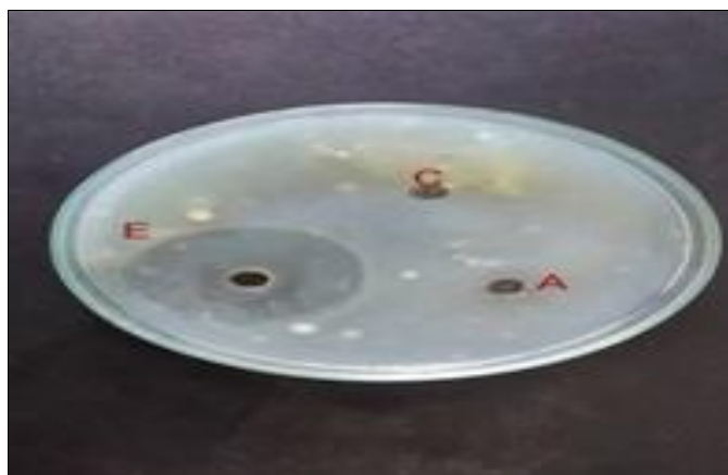
FIG. 3: ANTIMICROBIAL ACTIVITY OF AQUEOUS AND ETHANOLIC LEAF EXTRACT OF GREEN TEA ( CAMELLIA SINENSIS ) USED IN E. COLI . ZONE INDICATES THE PRESENCE OF ANTIMICROBIAL ACTIVITY